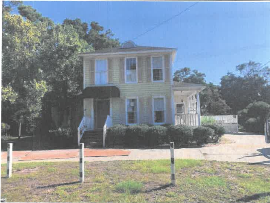
Photo One Caption FRONT VIEW

If using the Elevation Certificate to obtain NFIP flood insurance, affix at least 2 building photographs below according to the instructions for Item A6. Identify all photographs with date taken; "Front View" and "Rear View"; and, if required, "Right Side View" and "Left Side View." When applicable, photographs must show the foundation with representative examples of the flood openings or vents, as indicated in Section A8. If submitting more photographs than will fit on this page, use the Continuation Page.