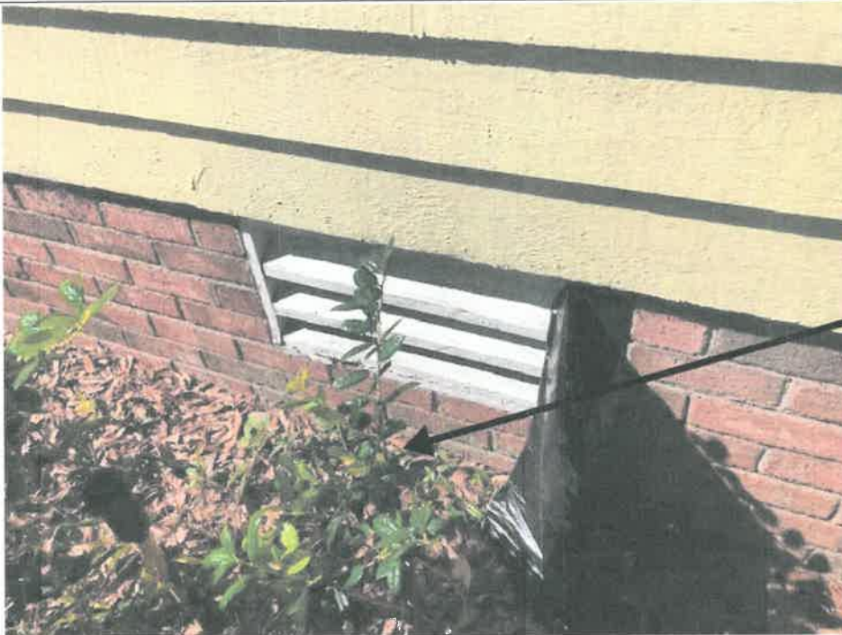
C2a. crawlspace of 1414 S.F (Elev.: 13.9')

If submitting more photographs than will fit on the preceding page, affix the additional photographs below. Identify all photographs with: date taken; "Front View" and "Rear View"; and, if required, "Right Side View" and "Left Side View." When applicable, photographs must show the foundation with representative examples of the flood openings or vents, as indicated in Section A8.