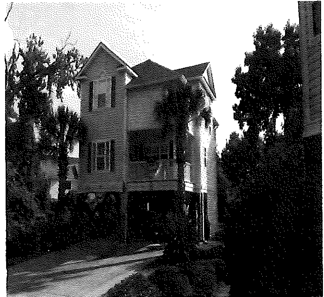
7/02/2015 Front Right side