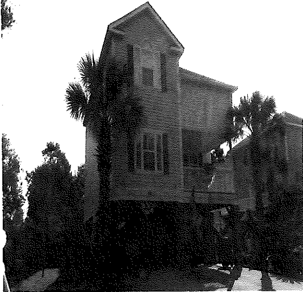
7/02/2015 Front Left side

If using the Elevation Certificate to obtain NFIP flood insurance, affix at least 2 building photographs below according to the instructions for Item A6. Identify all photographs with date taken; "Front View" and "Rear View"; and, if required, "Right Side View" and "Left Side View." When applicable, photographs must show the foundation with representative examples of the flood openings or vents, as indicated in Section A8. If submitting more photographs than will fit on this page, use the Continuation Page.