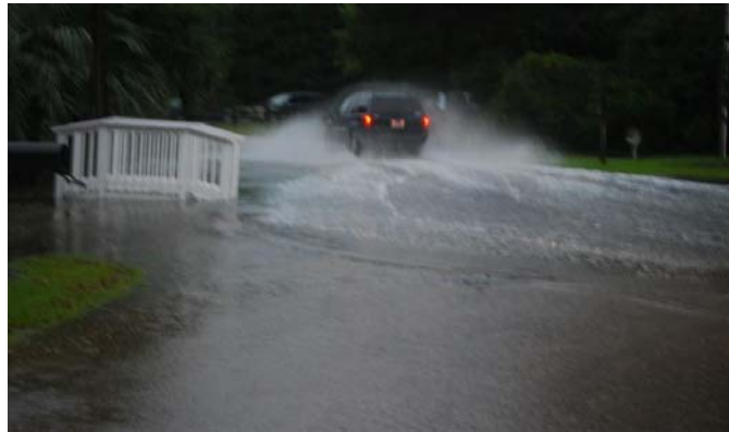
This picture was taken this August after Hurricane Irene. Surfside Beach, SC only received outer bands of the Category 2 Hurricane.

Elevation Certificates are also available for public review at the Building and Planning Department in the Town Hall building.