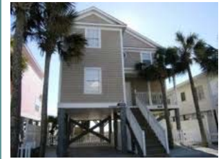
Flood insurance can be purchased on eligible residential and commercial buildings and/or their contents.

“Federal disaster assistance requires a Presidential Declaration, which happens in less than 50% of flooding events.”