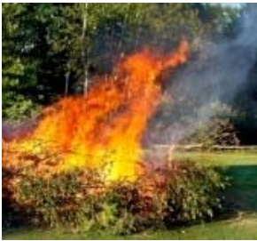
Please remember that burning of outdoor debris and leaves is not allowed within the Town limits.

“We would rather respond to you and find out that you did not need us than to not respond when you did.”