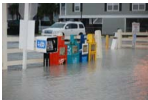
The Town of Surfside Beach is a participating community in the National Flood Insurance Program. Which means that you can purchase flood insurance to protect your property against the hazard of flooding.

“Personal property tax must be paid on all personal property, including business personal property used to generate business income within Horry County.”