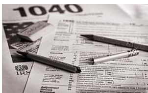
Horry County is in the process of preparing various property tax mailings, as detailed to the right.

“We would rather respond to you and find out that you did not need us than to not respond when you did.”