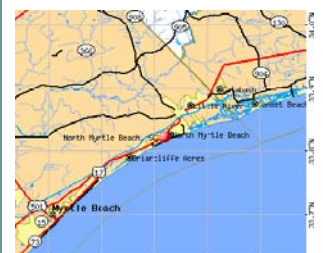
Official Flood Insurance Rate Maps (FIRM) offer more details of flood hazard areas and are available for review at the Town of Surfside Beach Building and Planning Department.

“Federal disaster assistance requires a Presidential Declaration, which happens in less than 50% of flooding events.”